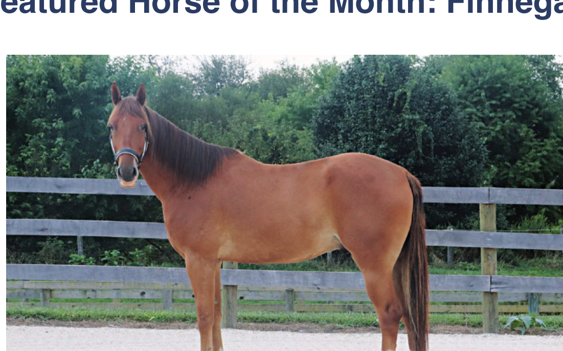
Five-year-old Quarter Horse gelding, 15.3hh

Finnegan is a sweet, in-your-pocket gelding ready to meet his forever family. He loves spending time with his herd mates but will stop his play to come say hello to the people in his world. He has a fun energy about him and would make a great non-riding companion horse. He has a fun energy about him and would make a great non-riding companion horse. He has a fun energy about him and would make a great non-riding companion horse.