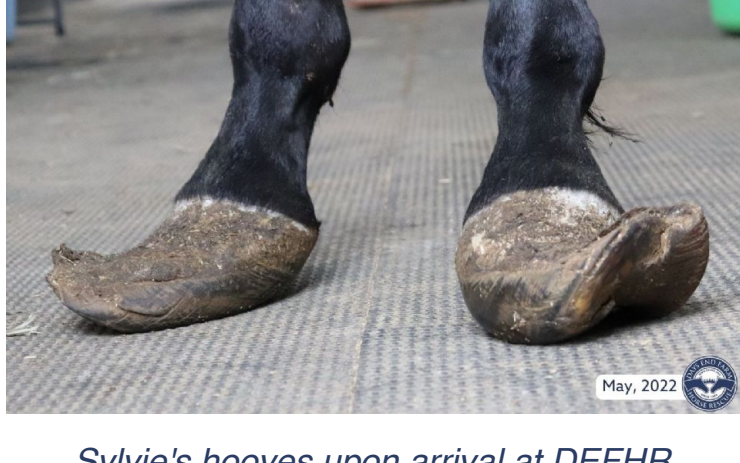
Sylvie's hooves upon arrival at DEFHR.