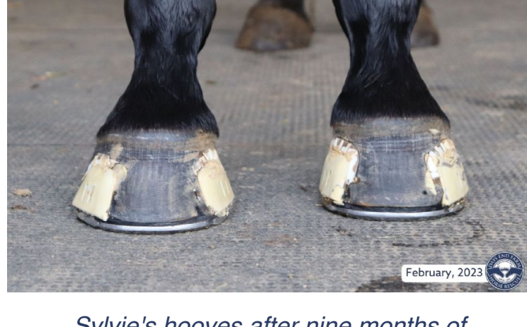
Sylvie's hooves after nine months of rehabilitation.

Sylvie came to Days End Farm Horse Rescue (DEFHR) in May 2022. When animal control authorities found Sylvie, she was locked in a stall standing on more than four feet of compacted manure. She had not seen daylight in months, if not years, and was in desperate need of farrier care. Correcting hoof neglect is one of the longest equine rehabilitation processes, and we are proud to show Sylvie's progress nine months later.